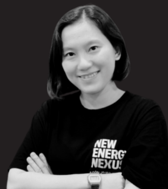
TU TRINH Project Lead