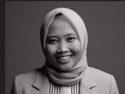
FAELA SUFA Engagement Manager