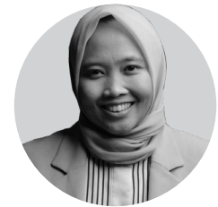
Faelasufa Engagement Manager